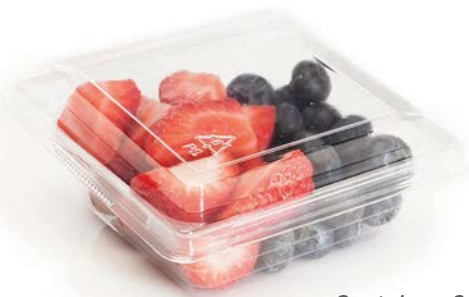
Container- 21828 Lid - 29332