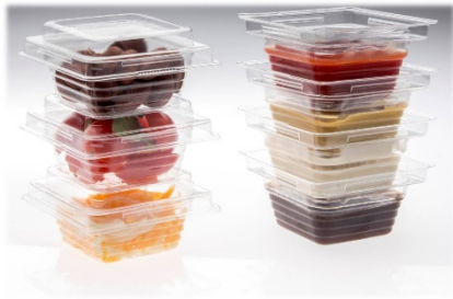
Container - 21482