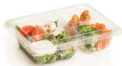
Tray - 82723 Lid - 82725