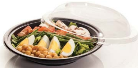
Bowl - 82638 Lid - 82639