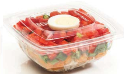
Bowl - 5BB008 Lid - 5BB200-DL