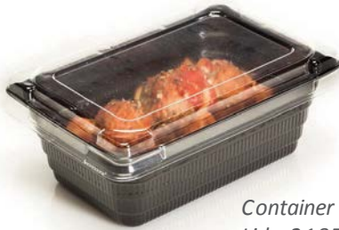
Container - 21980 Lid - 21879