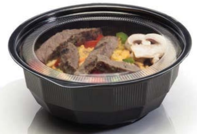
Bowl - 24025 Lid - 24200