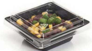
Container- 29927 Lid - 29332