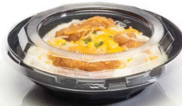
Bowl - 24009 Lid - 24400