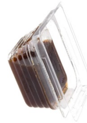
Lid - 21482L