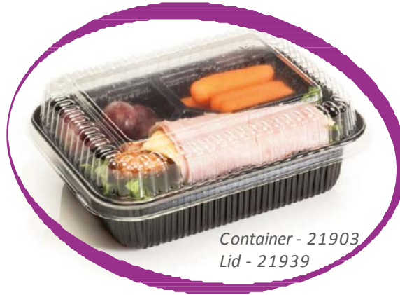
Container - 21903 Lid - 21939