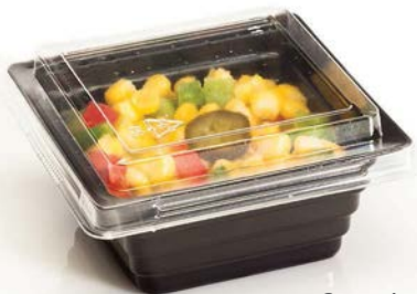
Container- 21935 Lid - 29332